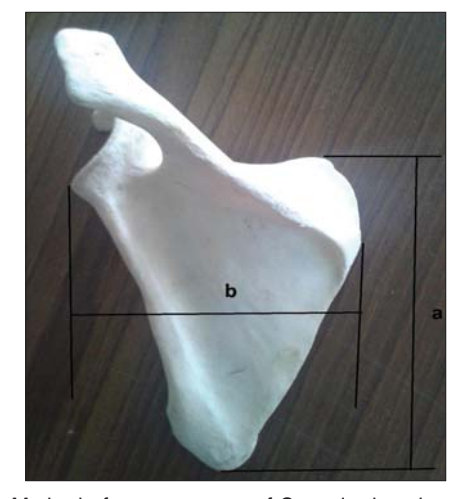
Figure 1: Method of measurement of Scapular length and breadth. a=maximum scapular height, b=maximum scapular breadth

Data are statistically analyzed and results are tabulated.