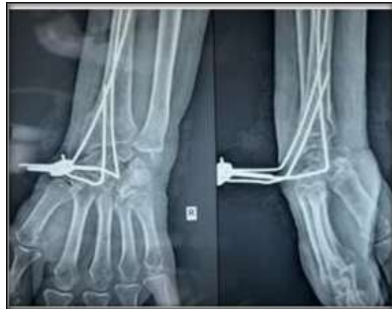
Follow up x-ray at 6 weeks