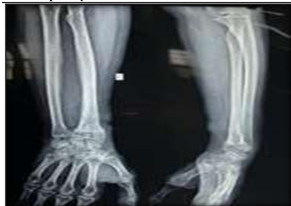
Follow up x-ray at 6 months