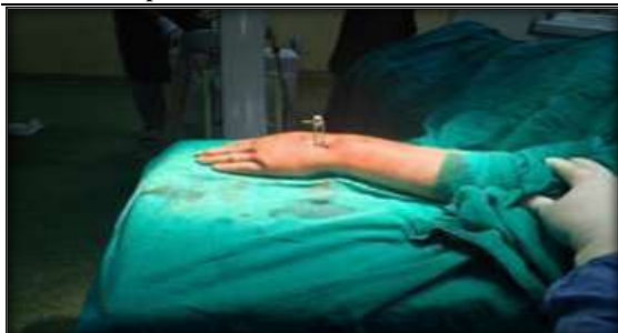
Figure 5: Lateral view after connecting K-wires with Joshi's clamp

Post operative follow up: Postoperative pain and inflammation were managed with analgesics, anti-inflammatory medications, and limb elevation. All patients received intravenous cefotaxime 1 g twice daily for two days, followed by oral cefixime 200 mg twice daily for five days. Active wrist movements along with shoulder, elbow, and finger exercises were initiated from the first postoperative day, as immobilization was not required. Patients were followed up at 3 weeks, 6 weeks, 12 weeks, and at 6 months postoperatively. Clinical and radiological assessments were performed at each visit to evaluate fracture union, functional recovery, and complications. Kirschner wires and Joshi's