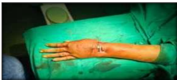
Figure 4: Superior view after connecting K-wires with Joshi's clamp