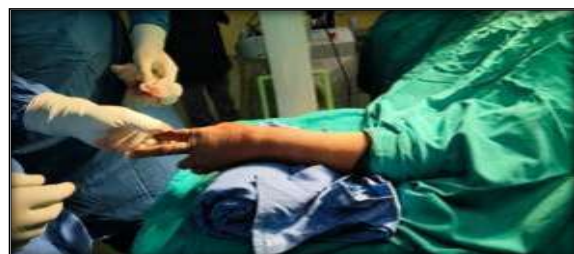
Figure 2: Closed reduction under C-arm