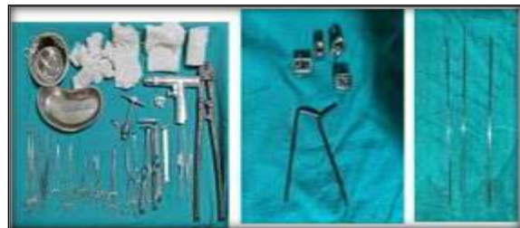
Figure 1: Instruments with Joshi's clamp, allen key and long K-wires

solution, sterile draping was done. Closed reduction of the fracture was achieved by traction and manipulation, and the adequacy of reduction was confirmed under C-arm fluoroscopy. The first Kirschner wire was inserted intramedullary from the radial styloid with a bent tip, passing between the first and second extensor compartments. The second Kirschner wire was inserted at the ulnar corner of the distal radius using the intrafocal (Kapandji) technique between the fourth and fifth extensor compartments, ensuring protection of the extensor pollicis longus tendon. A third Kirschner wire was introduced either intrafocally as a dorsal buttress or bicortically between the third and fourth extensor compartments to provide additional stability. In all procedures, 1.8mm or 2.0mm K-wires were used. After insertion, all Kirschner wires were bent and converged externally just above the wrist, where they were locked together using Joshi's external clamp. No postoperative slab or cast was applied as adequate stability was achieved with the fixation construct.