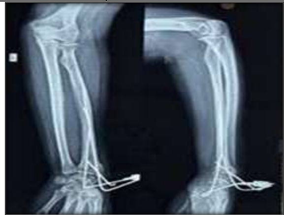
Follow up x-ray at 6 weeks