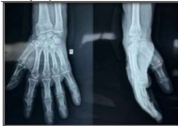
Follow up x-ray at 6 months