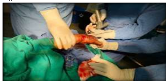
Figure 3: K-wire insertion