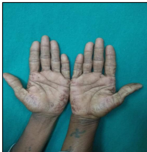
Fig 3: Acrokeratoelastoidosis of Costa