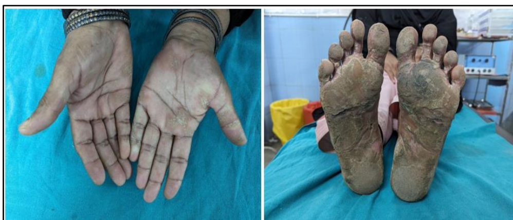
Fig 1: Palmoplantar psoriasis

Palmoplantar psoriasis was evident in 43 males and 28 females. 38 males and 32 females had eczema. Trophic ulcer was evident in 23 males and 37 females. Drug reactions were seen in 39 males and 23 females. 45 males and 21 females had viral infection. Fungal infection was seen in 52 males and 24 females.