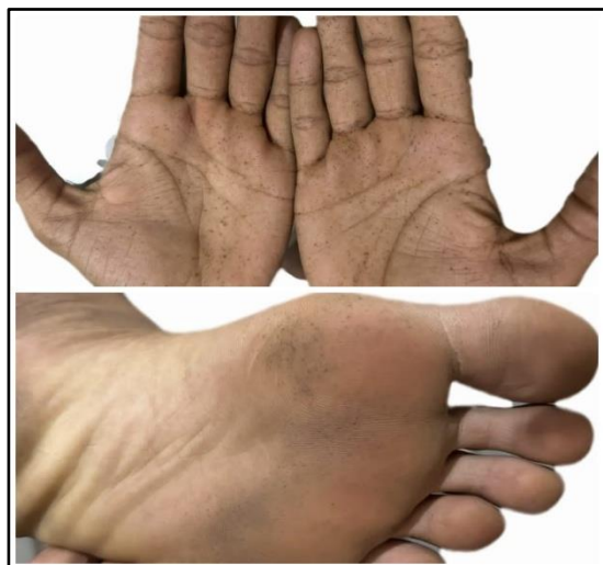
Fig 2: Reticulate acropigmentation of Kitamura