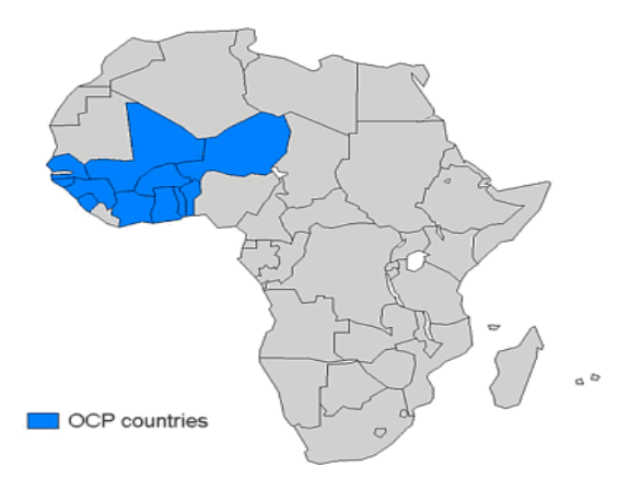
Figure 6: Map of Africa showing the OCP countries. WHO, 2018b.

Between 1974 and 2012, in West Africa using mainly the spraying of insecticides against black fly larvae (vector control) by airplane and helicopters.<sup>8</sup> The Onchocerciasis Control Program (OCP) relieved over 40million people from the infection, prevented blindness in 600,000 people and ensured that 18 million children were born free from the threat of the disease and blindness.<sup>8</sup> In addition, 25 million hectares of abandoned arable land were reclaimed for settlement and agricultural production capable of feeding 17 million people.<sup>8</sup>