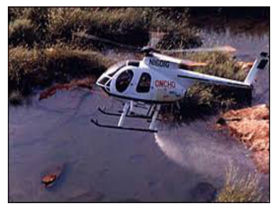
Figure 7: Larvae control of Onchocerciasis; Helicopter, WHO, 2017.

However, in 1995 experienced the lunched of the Africa Programme for Onchocerciasis Control (APOC), with the objective of controlling onchocerciasis in the remaining endemic countries in Africa and closed at the end of 2015.8 The APOC is a bigger partnership programme than OCP including 19 Participating Countries (Figure 8) with effective and active involvement of the Ministries of Health and their affected communities, several international and local NGDOs, the private sector (Merck and Co., Inc.), donor countries and UN agencies.<sup>50</sup> The World Bank is the Fiscal Agent of the Programme and WHO is the Executing Agency of the Programme. The Community-Directed Treatment with Ivermectin (CDTI) is the delivery strategy of APOC.<sup>8,42</sup> It empowers local communities to fight river blindness in their own villages, relieving suffering and slowing transmission.<sup>8,42</sup> In Africa Programme for Onchocerciasis Control's final year, more than 119 million people were treated with Ivermectin and many countries had greatly decreased morbidity associated with onchocerciasis. More than 800,000 people in Uganda and 120,000 people in Sudan no longer required Ivermectin by the end of 2015.8 Then, begins the transition into the Expanded Special Project for the Elimination of Neglected Tropical Disease in Africa (ESPEN).<sup>7,8</sup> The establishment of the Expanded Special Project for the Elimination of Neglected Tropical Disease in Africa; with sustainable