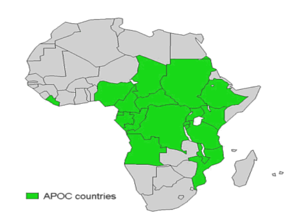
Figure 8: Map of Africa showing the various APOC countries. (WHO, 2018b).