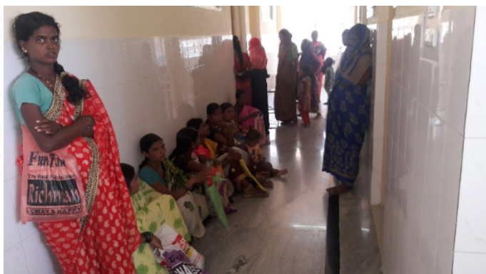
Figure 2: ANC clinic.

Centre (CHC) present across India, excluding medical colleges and more than 80% of these facilities lack blood storage facilities. 12