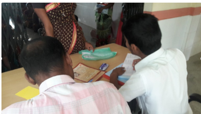
Figure 3: Data Collection.